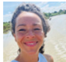
Kathrin Krabbe Social Media